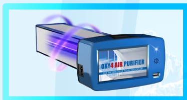
OXY 4 Purifier